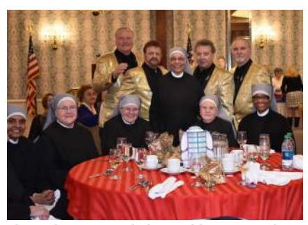
The Little Sisters with the World-Renowned Acchords

and auction tickets throughout the evening. Everyone had the unique opportunity to purchase some delicious homemade scones.